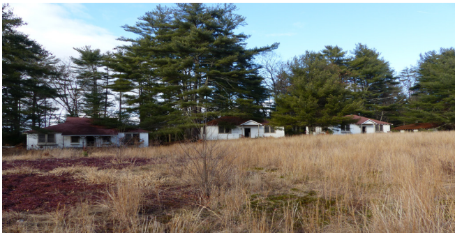
Three cabins at the edge of the grassy field.

a bit more involved than just pushing the buildings over! The asbestos survey discovered three buildings with "hits" including tiles, tile mastic and windowpane caulking. The removal process was challenged by severely deteriorated roofs and floors after years of water damage and rot. Our awesome collaborators at Brown's stepped over those hurdles and each building was successfully removed. Local friends and supporters reused some windows, doors, stones, stone tiles, metal, wire and even the industrial sized freezer unit. The rest was crushed and hauled away to ReSource Waste of Ware, who supported this re-wilding effort by lowering their tonnage rate significantly, as a donation. ■