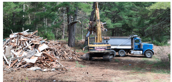
Loading the truck for disposal.