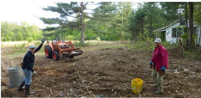
Volunteers hand picking debris from the former cabin sites.