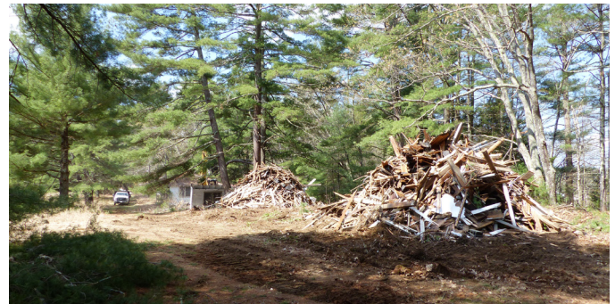
Two cabins demolished and prepared for removal.