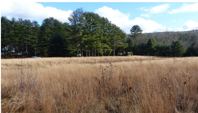
The field full of little bluestem grass is important wildlife habitat to promote.