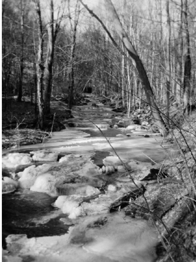
Looking up Danforth Brook with winter ice forming.

These tasks are necessary, but hunting for iron pins and