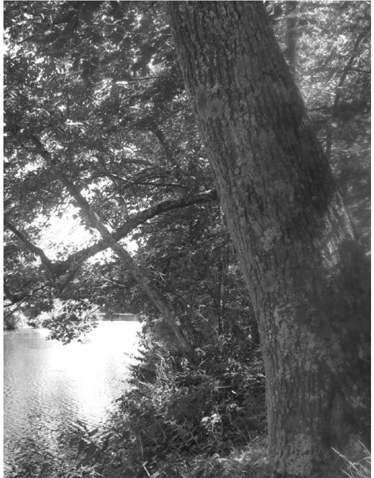
Along the edge of the Ware River.

Pitch Pine Barrens are fire adapted natural communities that typically occur on the poor, sandy soils of glacial outwash. Because of their extremely dry nature, barrens communities are prone to regular fire events. With harsh growing conditions and regular fires to contend with, barrens have evolved to support a suite of slow-growing, drought-resistant, fire-adapted plant species such as pitch pine, scrub oak, lowbush blueberry and warm season grasses. A healthy barrens community is the key habitat of such species as the whip-poor-will. However, with the relatively recent advent of widespread fire suppression, the fire events are mostly