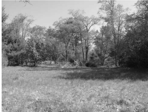
Some pasture at the Frohloff Farm.

Beyond invasive control in the Pasturelands, a main mission on the Frohloff Farm is to model agricultural practices that are mutually beneficial to both wildlife and the farmer. EQLT has found that grazing can be a key component of this mission, as shown by the relationship between EQLT and Ridge