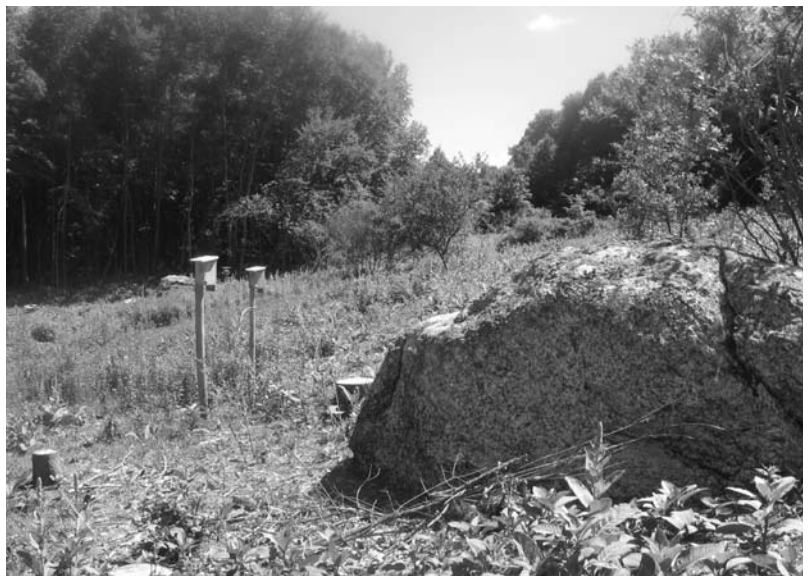
Bluebird boxes in the Leehy's newly cleared field.

Linda and Rod Leehy cleared the area along both sides of Danforth Brook in order to improve the food and cover available for birds and animals that use shrubby areas during the year. As the shrubs grow they play host to all kinds of insects and rodents that in turn attract birds, reptiles and larger mammals. Linda and Rod are also making an effort to remove the non-native plant species that had invaded their property, like multiflora rose, honeysuckle and bittersweet. This will favor the return of native shrubs to the clearing.