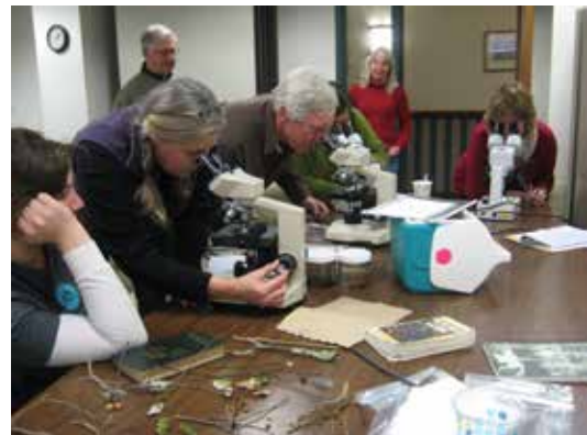
Checking samples of insects and tiny creatures using microscopes as part of the Pynchon's Grist Mill Preserve bioblitz.