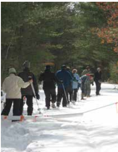
Winter tracking at the Cernauskas property along the Ware River in Wheelwright