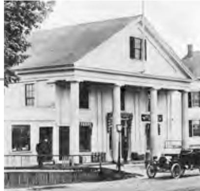
The Country Store, circa 1923

~ Thornton Wilder, 1897–1975, American novelist and playwright, his works include the classic play, Our Town