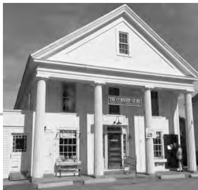
The Country Store, 2013

Berube Real Estate of Petersham, MA donated funding support for printing of this catalogue.