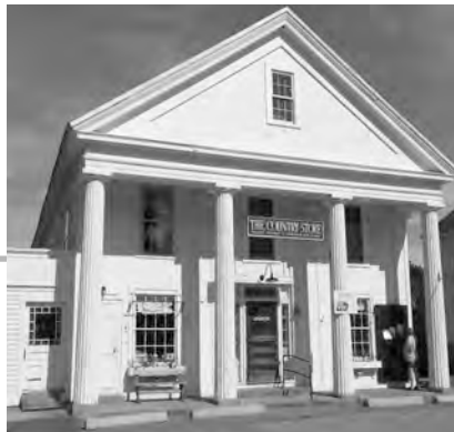
The Country Store, 2013

Berube Real Estate of Petersham, MA donated funding support for printing of this catalogue.