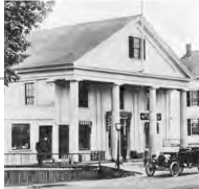
The Country Store, circa 1923

~ Thornton Wilder, 1897–1975, American novelist and playwright, his works include the classic play, Our Town