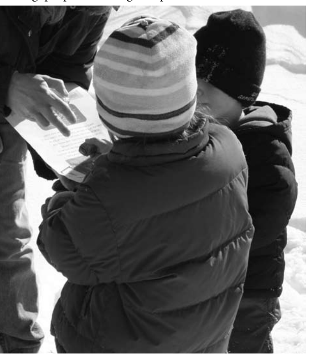
Some youngsters getting help stamping their Food Web Quest at Mandell Hill.

Spring has sprung, which means that vernal pools will soon be full of life! The kids from the Hardwick Youth Center are coming on a trip to explore the vernal pool at Patrill Hollow Preserve. The kids will get to see some cool amphibians such as wood frogs and spotted salamanders. Even if we don't see any of those critters,