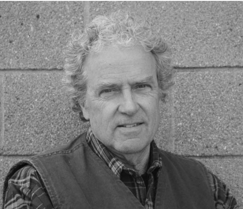
an agricultural land bank higher in my priority. We need to work harder to conserve our critical farmland and keep it available for farmers. With the current state of the economy and land values we can't expect farmers to continue working the land if they have to pay a huge mortgage on top of making a living.

JR Last weekend I attended the Mass Land Conservation Conference and attended several informative workshops. It's pretty clear that entry level farmers, with their limited resources are not going to have sufficient capital to purchase land. It was interesting to learn that at the present time about 40% of all agricultural land in the country is rented or leased. So with that context, it puts the notion of the land trust as