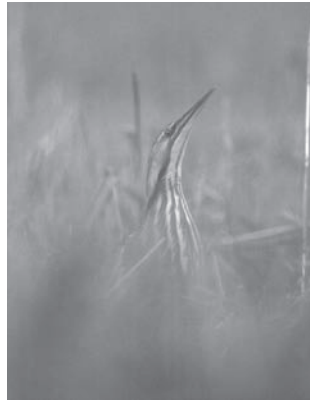
A konkapot on the Quaboag.

Below Quaboag WMA is the lesser-known gem of the Quaboag River; the Quaboag Narrows in West Warren. Here the River is deflected south by dramatic topography as it is constricted between Fox Hill and Devils Peak along Route 67. This long stretch of the Quaboag features relatively steep drops in elevation and powerful rapids during high water, and is also home to a suite of rare invertebrates such as highly specialized dragonflies and fresh water mussels that have adapted to these turbulent conditions. The