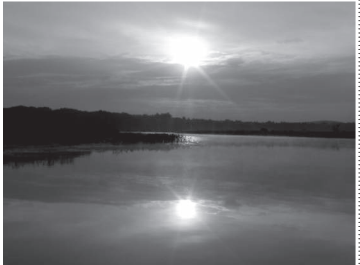
Sunset on the Quaboag.

Just as the waters of the Quaboag River sustained the Quaboag Tribe for centuries – references suggest farming here as early as 300 AD – the river and its associated plains were also attractive