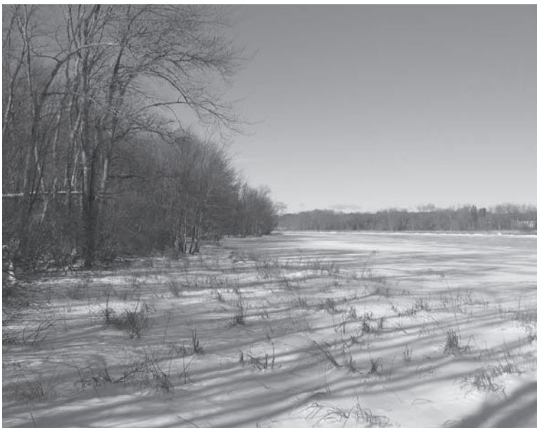
River Frontage looking westerly from central part of West Brookfield Property.

The Massachusetts Department of Fish and Game were negotiating with the landowner to purchase the land when the property was foreclosed on. The bank was eager to sell the land to the highest bidder. Due to the state’s fiscal situation it could not purchase the land directly and so asked the East Quabbin Land Trust to purchase the land. The land will be transferred to the Massachusetts Department of Fish and Game this summer or early fall.