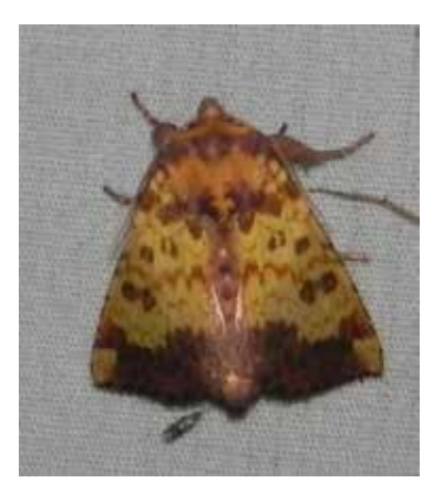
Golden Borer Moth (Papaipema cerina)