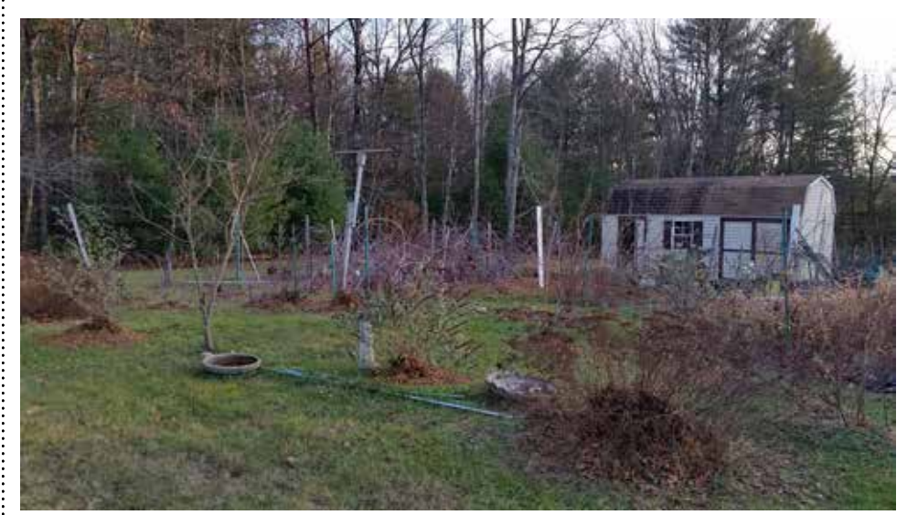
Ken and Genevieve Groeppe's garden with butterfly bush and raspverries, among others, that are beneficial to bees and butterflies

Vegetable gardening is a passion for many. Producing the perfect tomato, or stocking up on green beans, squash and apple sauce for winter are signs of a successful growing season. We put in a lot of hard work preparing the soil, sowing the seeds and weeding the beds. Many of us probably miss the critical helping hand (actually the helping body) of the insects that pollinate the flower blossoms for us. Production of over 50% of the fruit, vegetable and nuts we consume are dependent on bees or other insect pollinators.