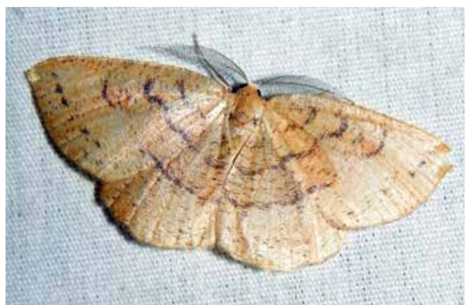
New Jersey Tea Inchworm moth (Apodrepanulartrix liberaria)

The state-status Threatened Pine Barrens Zanclognatha (Zanclognatha martha) adults are out in July and early August after their larvae pupate in June. These moths, whose larval plant is pitch pine, are less than an inch across and their wings get darker towards the outer edges. Brian collected pitch pine seeds and is germinating them to increase the amount of pitch pine along Muddy Brook.