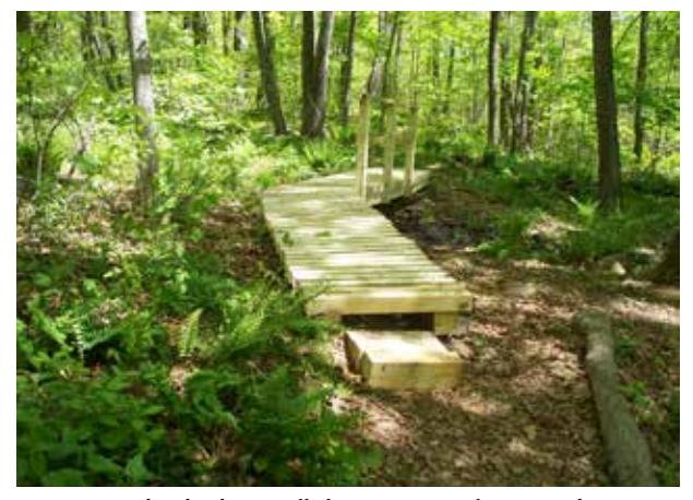
New bog bridge installed at Moose Brook Preserve by Eagle Scout candidate Sam Arcikowski