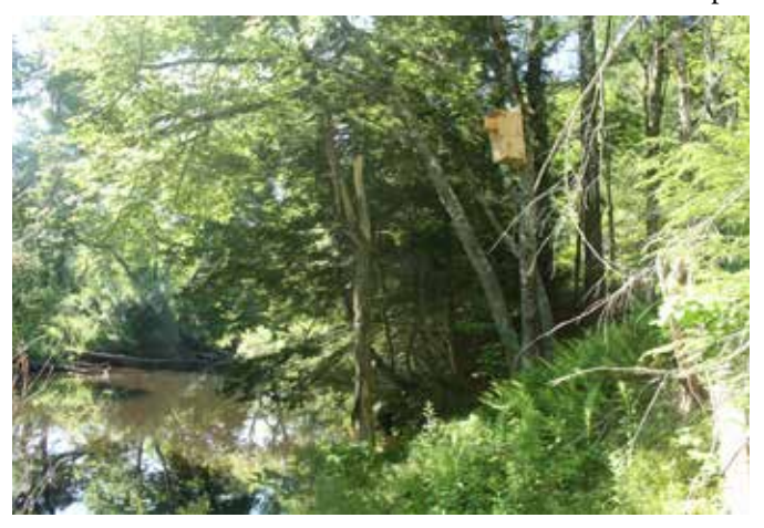
A wood duck box along the Ware River at the Cernauskas property.

The property includes over 1,800 feet of the Ware River, which is identified as Priority Habitat by the Natural Heritage and Endangered Species Program. Wood turtle is certainly one of the species of concern in the area. Freshwater muscles and a few dragonfly species are also probable species of interest along this section of the Ware River.