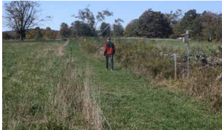
A visitor to Mandell Hill enjoying the trails through the fields.

In conclusion, this study states that "conservation lands contribute to the economic well-being of the state by attracting visitors who spend money in local communities; supporting local farmers, forest product workers, and fisherman acting as a catalyst for rural and urban economic development; and leading to major savings in health care costs." ■