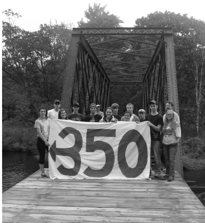
The Quabbin Regional High School students at the end of a successful workday laying down timbers at the lattice truss and clearing brush along the rail trail.

By the time you read this a second work day will have happened with a goal to lay down half the remaining deck timbers. Come on out and see how far we got!