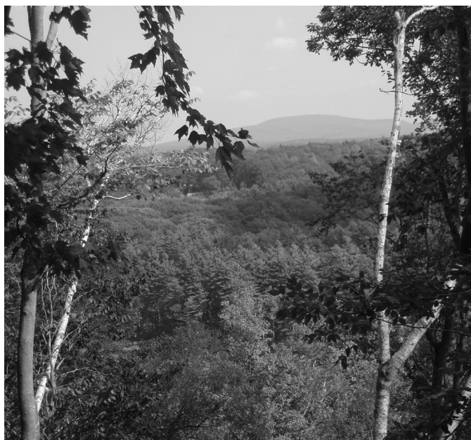
The view of Mount Wachusett looking across the wooded landscape from one of the properties included in the application.